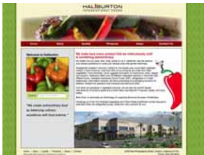
New Website home page

New Logo, New Website, Same Impeccably Roasted Veggies.