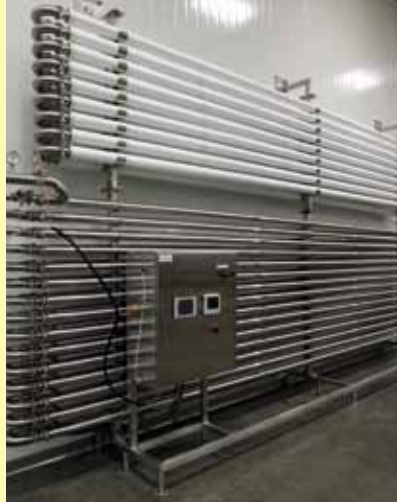
Feldmeier Heat Exchanger

For almost two decades, Haliburton has been manufacturing a full line of fully pasteurized, aseptically filled vegetable bases and purees. As growth in this category of our business continues, the need for additional processing capacity was recently addressed with the installation of a new Feldmeier heat exchanger and Dupont aseptic filler. The addition of this new processing equipment means increased manufacturing capacity and additional packaging options for our customers.