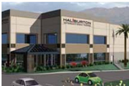
Ontario, California Manufacturing And Distribution Facility

Welcome to Haliburton International Foods, although we are still the same company from whom you can expect exceptional Center-of-the-Plate IQF roasted and grilled vegetables, unique soups, sauces, marinades and spreads, we have renovated and updated our brand image. We have a new logo, a new corporate design look and image and a new website that better explains and illustrates our capabilities – and the many ways we can help you do what you do better. Please visit our new site at www.haliburton.net to see for yourself. Haliburton, equal parts food, science and taste.